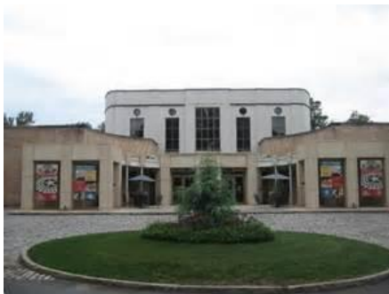
Atlanta History Center