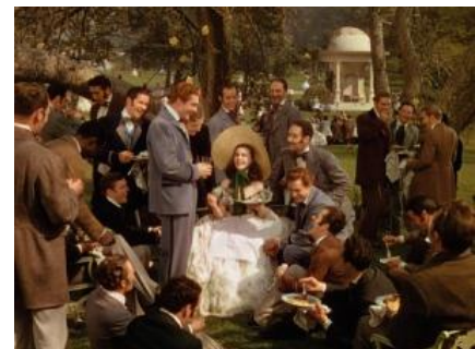
Southern BBQ In 1861